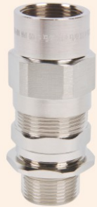
Steel pipe wiring